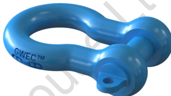
(Product Code STDR - 9102)

BS3032 Large Dee (Fig.2) & Bow (Fig.3) Shackles are available with Screwed Pin with eye and collar (Type A or B), Countersunk Screwed Pin with slotted or sunk square socket (Type C or D), Bolt & Nut c/w cotter (Type E) or Plain Cylindrical Pin c/w head & forelock (Type F). Shackles are supplied painted as standard.