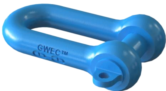
(Product Code STDR - 9101)